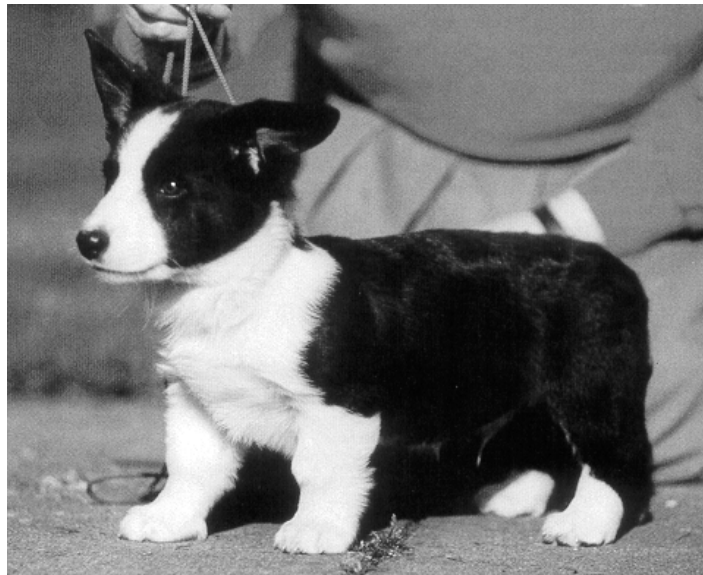
Ch. Beckrow Be My Hope, born 13-01-1995, as a puppy

If we have got a bitch that maybe had one litter or perhaps two, we will let them go into a pet home provided the right home comes along. They have much more fun in a home where they are the only one. Usually they are three, or maybe four years old, sometimes, they're even younger than that. If they're over six years, they stay. We just let them live their lives out with us.