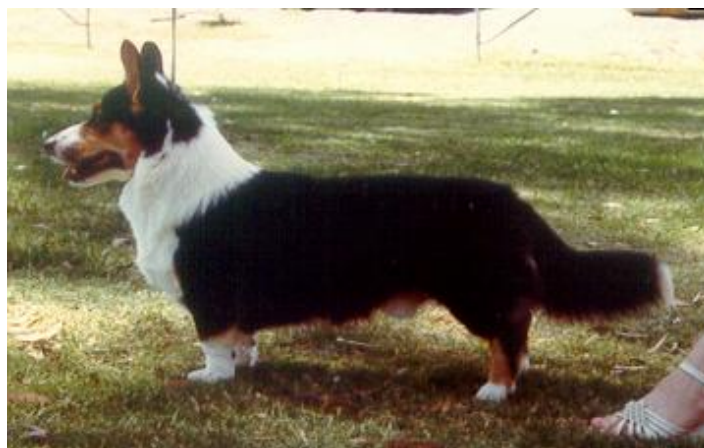
Ch. Beckrow Barona Doubtful

I acquired my first Cardigan in 1969, Rozavel Blue Lace of Beckrow (Rozavel Galwynt – Rozavel Blue Spark). She was rather large, but she proved to be an absolutely fantastic brood bitch! She only had two litters. In the first litter by Rozavel Merioneth came Ch. Beckrow Bandelero, who was the first tricolour male champion in the UK. And in her second litter equally by Rozavel Merioneth, she produced the fabulous Aust. Ch. Beckrow Barona Doubtful, who went to Australia and is the top sire in Cardigans of all time in Australia.