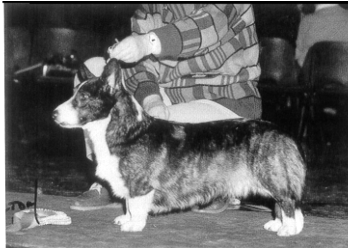
Ch. Beckrow Beverly at Willowglen JW, Top Cardigan 1985

All my puppies' names begin with B! The blues are all Blue something, and the blacks are nearly all named after racehorses or show jumpers. But they all begin with B.