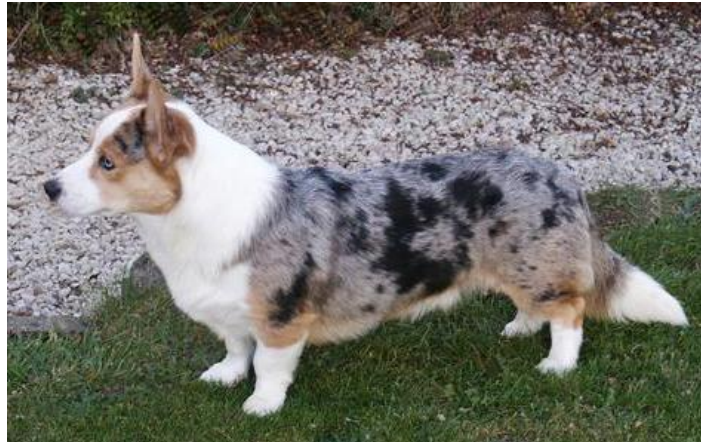
Ch. Beckrow Bleu Superbe, born 22-09-2000

was 10 years old he won his 36th CC and the breed record, his father Ch. Beckrow Blue Cedar won 30 CC's before he emigrated to a friend in the States.